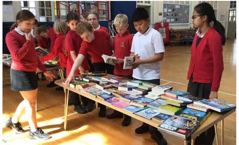
Year 5s and 6s enjoying choosing their new books and Star Wars Fun!